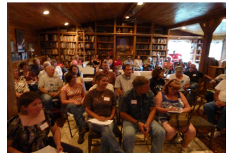
Equestrian Trail System Project by the Chautauqua County Department of Economic Development