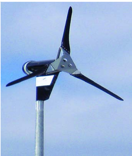
Small Wind Laboratory sponsored by SUNY Alfred State College