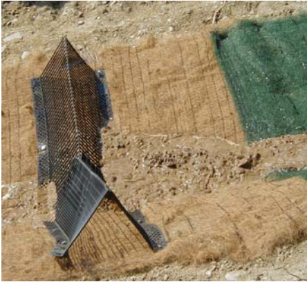
Muddy Water Blues Stormwater and Equipment Demonstration

In April 2011, Southern Tier West received funding from NYS Department of Environmental Conservation under Section 604(b) of the Clean Water Act for three projects: the Southern Tier West Baseline Program, Western New York Watershed Protection Planning Project (Erie County), and the Chautauqua Institution Storm Water Quality Treatment Program.