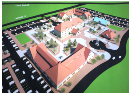
Crossroads Development Water Infrastructure Project sponsored by the Allegany County Department of Development