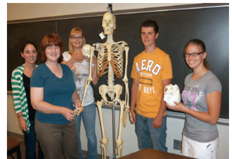
3-D Forensics Project sponsored by Jamestown Community College