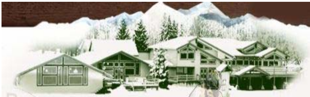
Swain Ski Resort - Allegany County